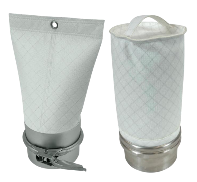
Polyester Needle Felt Breather bags and filter socks

Filcoflex B.V. The Netherlands Luxemburgstraat 3 5171 PK Kaatsheuvel