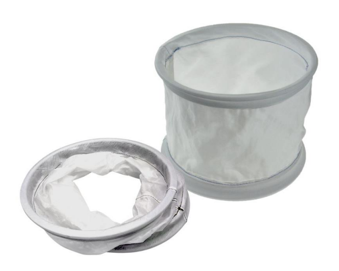
Woven Fabric (without coating) Flexible connectors and sleeves

Filcoflex offer disposable solution for cost saving and hygienic and easy connection of breather bags. We will gladly send you more details.